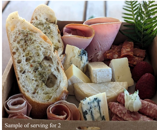
Sample of serving for 2